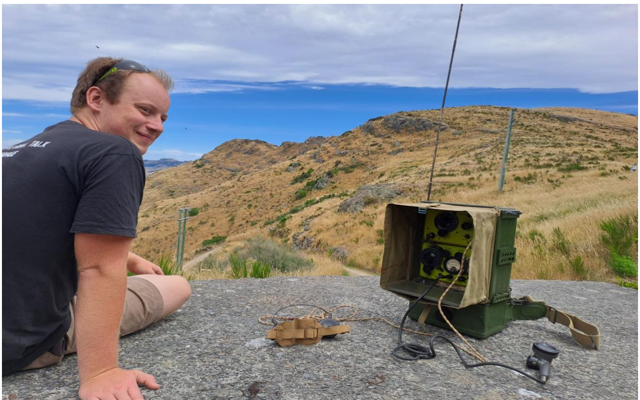
Braden ZL1BRK- More fun operating than carrying the '48