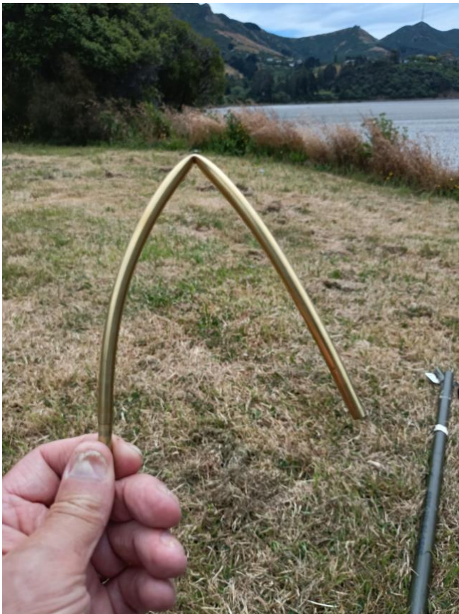
Just as well it wasn't a genuine aerial section. Would be a bit difficult to straighten up.

-And that's all for this month. 73, Martyn ZL3CK