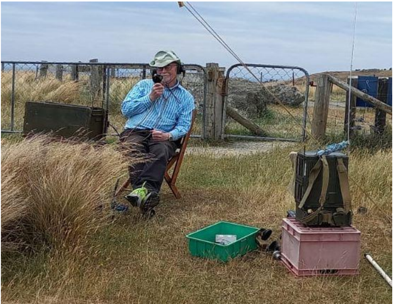
First-timer ZL1TAM relaxing with a ZC1