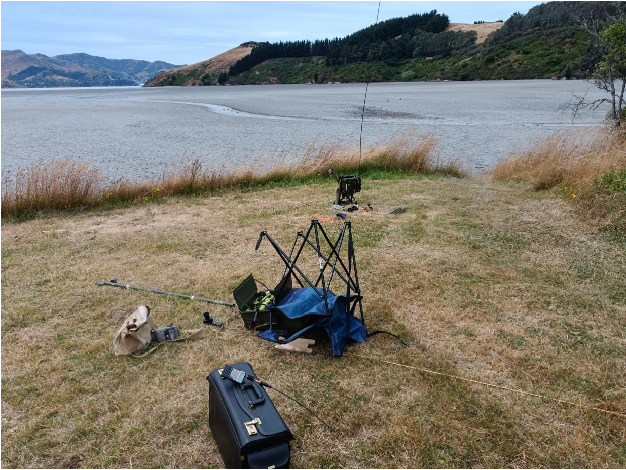
Ouch! Capsized '48 set on an obviously too-light-for-the-Nor'Wester chair